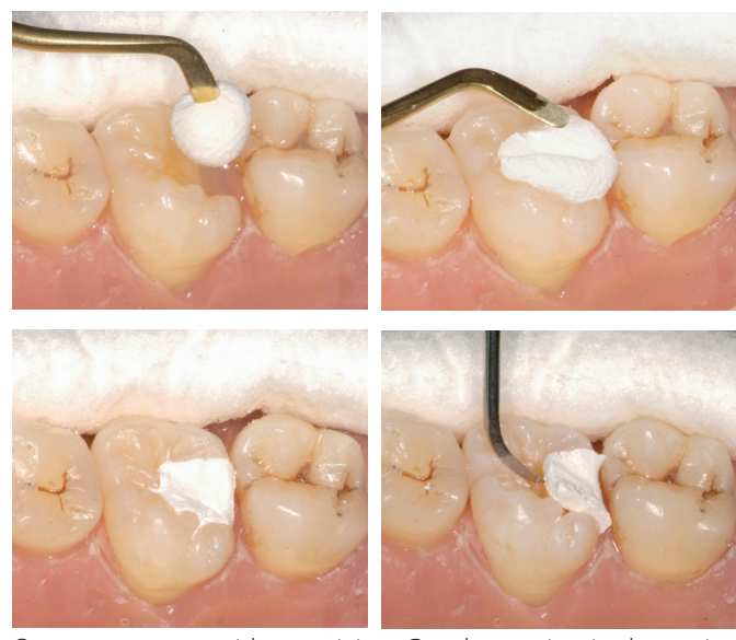
One component without mixing. Good retention in the cavity. Easy removal.

235 Ascot Parkway Cuyahoga Falls, OH 44223 / USA Tel. USA & Canada + 1 800 221 3046 + 1 330 916 8800