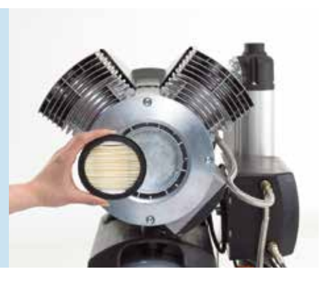
Easy change of central intake filter for worry-free operation and long service life.