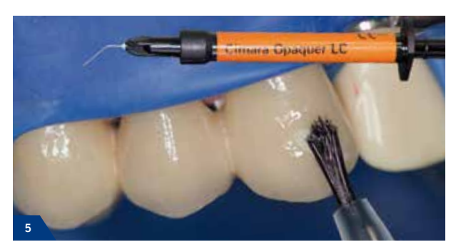
Thin coating with Cimara Opaquer LC. Light-curing for 40 seconds