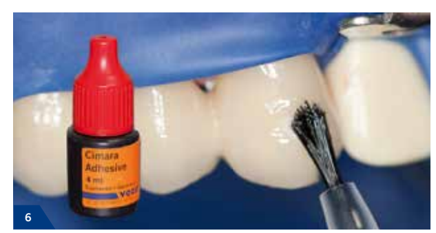
Coating the prepared surface with a thin layer of Cimara, finely dispersing it with a gentle stream of air and light-curing for 20 seconds afterwards